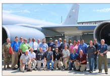
The Wisconsin Employer Support of the Guard and Reserve conducted a Boss Lift in 2016 with the support of the Wisconsin Air National Guard's 120th Air Refueling Wing out of Milwaukee. Twenty-one employers from southeastern Wisconsin received a warm welcome to the Air Base. See page 15.

March 20, 2018 Download the most current free edition here: www.CenterForAmerica.org/wis_guide.html